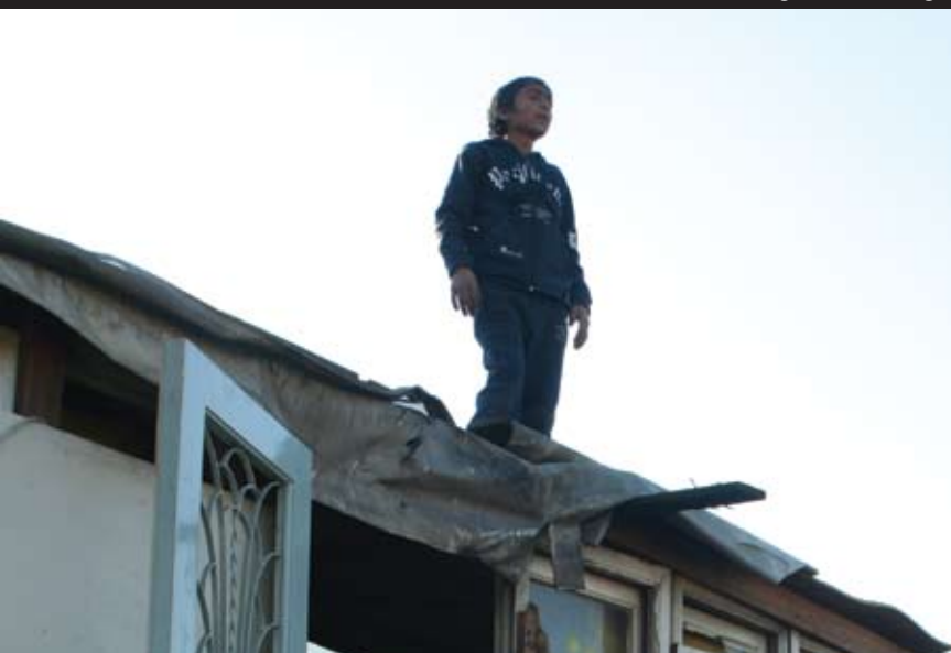
Gogo on the roof of his house

(ISO 9007:2000. Compatible with all international standards)