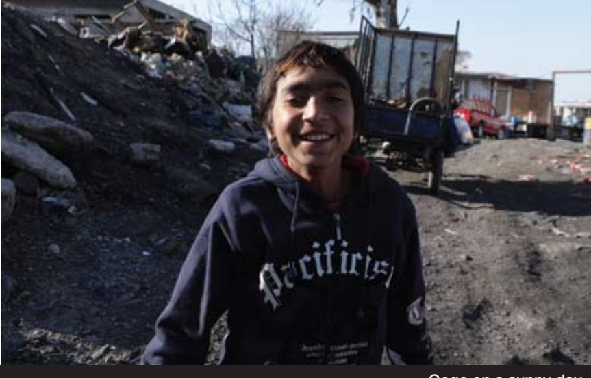
Gogo on a sunny day