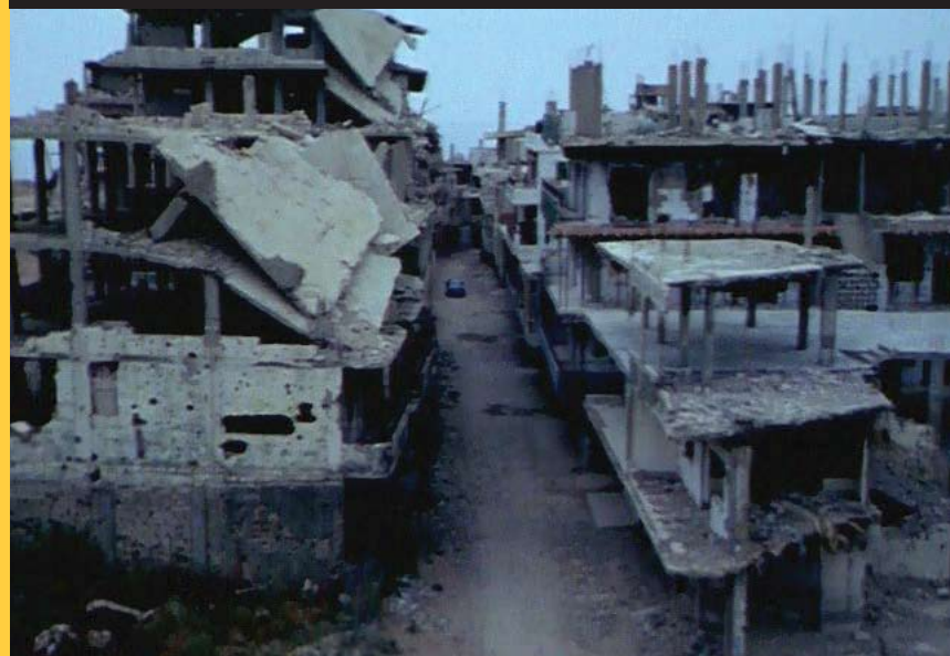
In building we trust