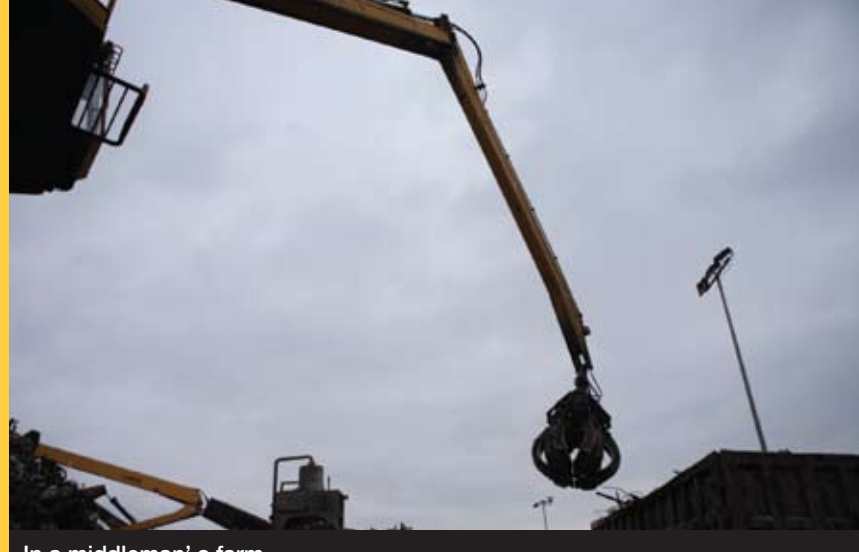
In a middleman's farm