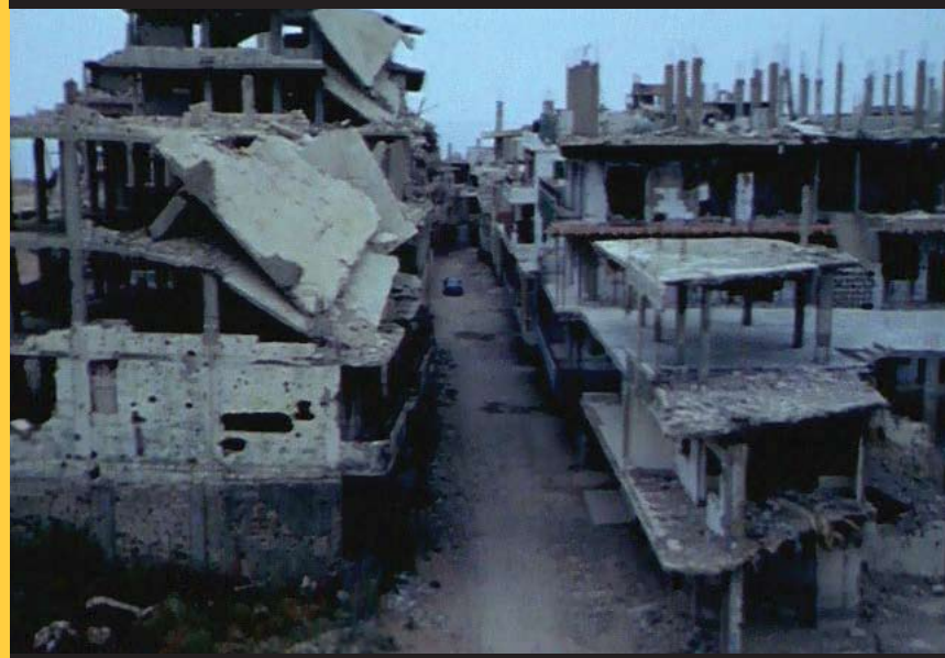
In building we trust