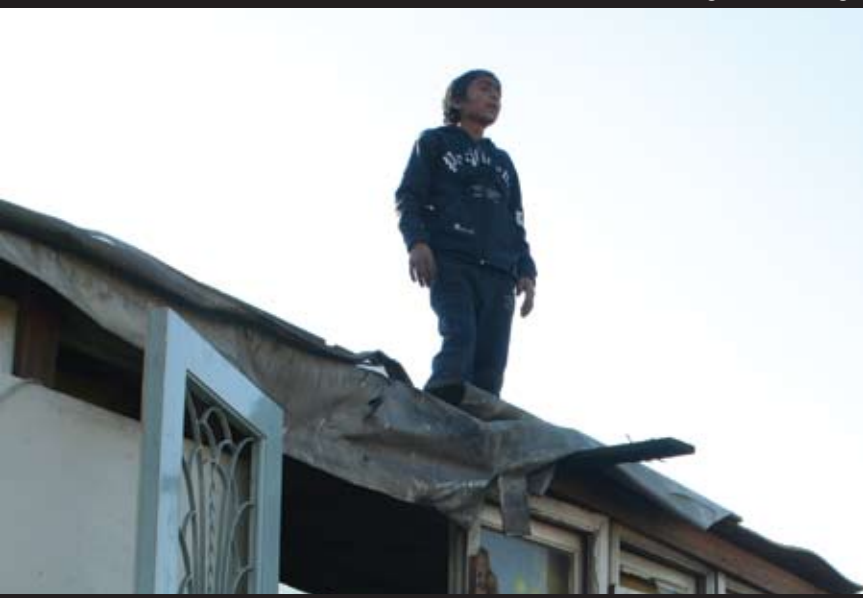
Gogo on the roof of his house

(ISO 9007:2000. Compatible with all international standards)